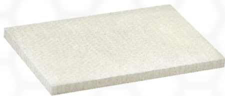
CLEARSTEP/POLISTEP Fiberglass skins Polypropylene honeycomb core

Our wide range of raw materials, both skins and cores for sandwich panels, allows us to meet the specifications of any project.